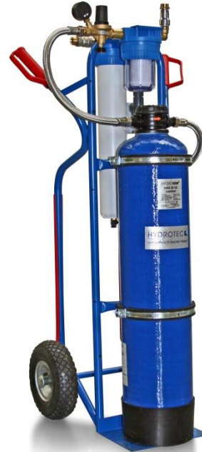
This picture shows an example of a system HYDRO ION® HAS 25 VE Comfort